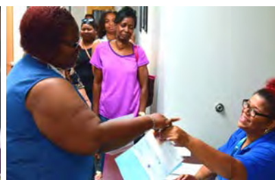
Incentive checks distributed to GSOD teachers totaled more than $1.5 million.