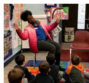
ELC staff celebrates Children's Literacy Week 2019