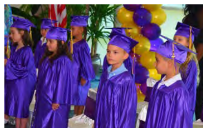
2019 VPK graduation