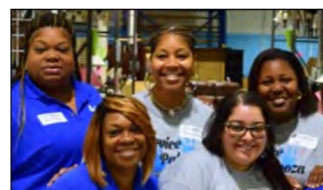
ELC of Duval's Day of Service in the community