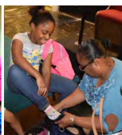
Back to School Shoes and Socks Drive