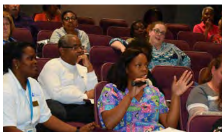
ELC of Duval conducted two Town Hall meetings with child care providers.

Family Engagement works with providers and community partners to ensure children benefit from a wide variety of programs and resources, including United Way's Born Learning classes, the Kids Hope Alliance, which funds our Raising a Reader program, and PNC Bank which supports our family engagement efforts in many ways. PNC sponsors the "Grow Up Great Children's Closet" located at Gateway to Heaven Christian Church. Kid to Kid and Clothes 4 Souls are also sponsors of the Closet.