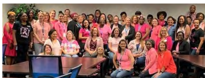
ELC of Duval holds a "Pink Out" as part of Breast Cancer Awareness Month